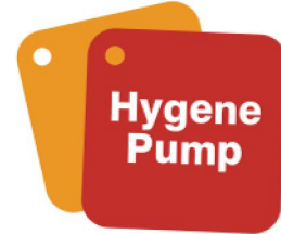
SS 304/316 Coupled Centrifugal